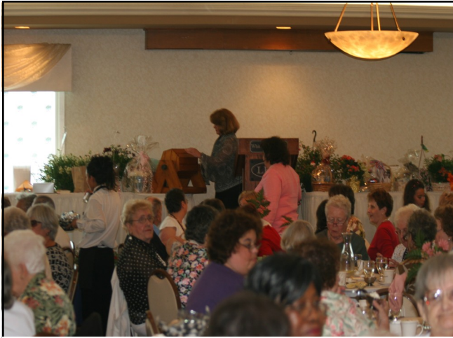
Volunteers enjoy last year's luncheon at White's of Westport . Volunteers who serve fifty or more hours at RSVP sites during the year receive an invitation - call today to be placed at the American Lung Association , Ronald McDonald House , or another exciting site!